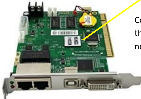
NOVASTAR LED SENDING CARD

Colorlight and Novastar looks similar but the difference is in the Audio "BLUE" connector that is in the Colorlight card .