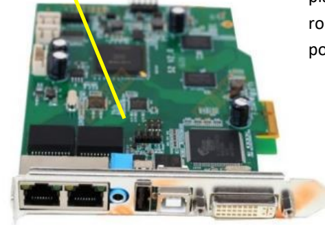
COLORLIGHT LED SENDING CARD